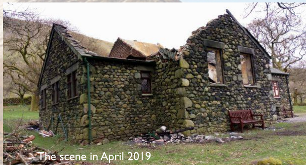
The scene in April 2019

In the 1930s, the Club built Brackenclose with donations from members, at a cost of about £1,500. What an investment!