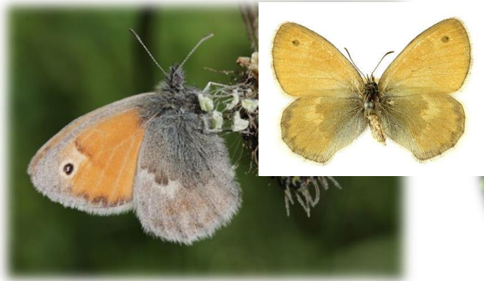
Small heath ( Coenonympha pamphilus )