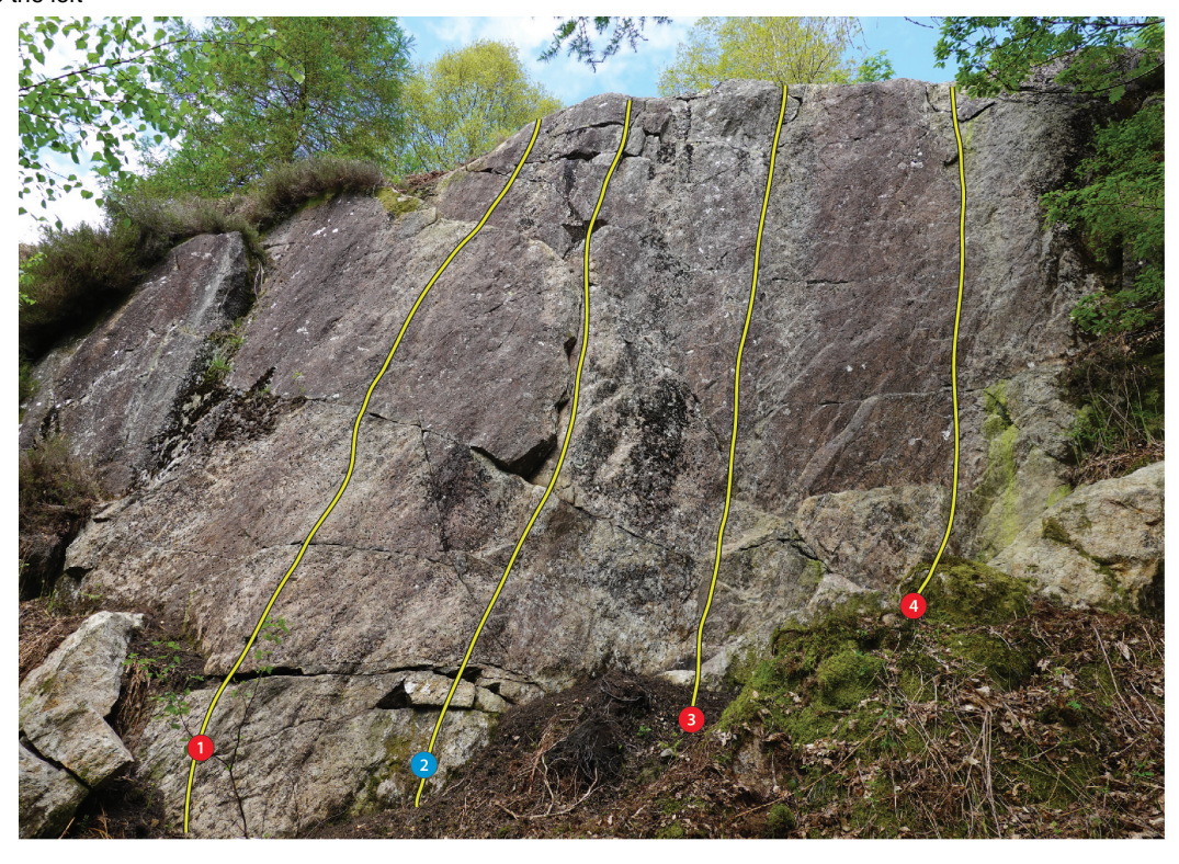
Tongue House Wood