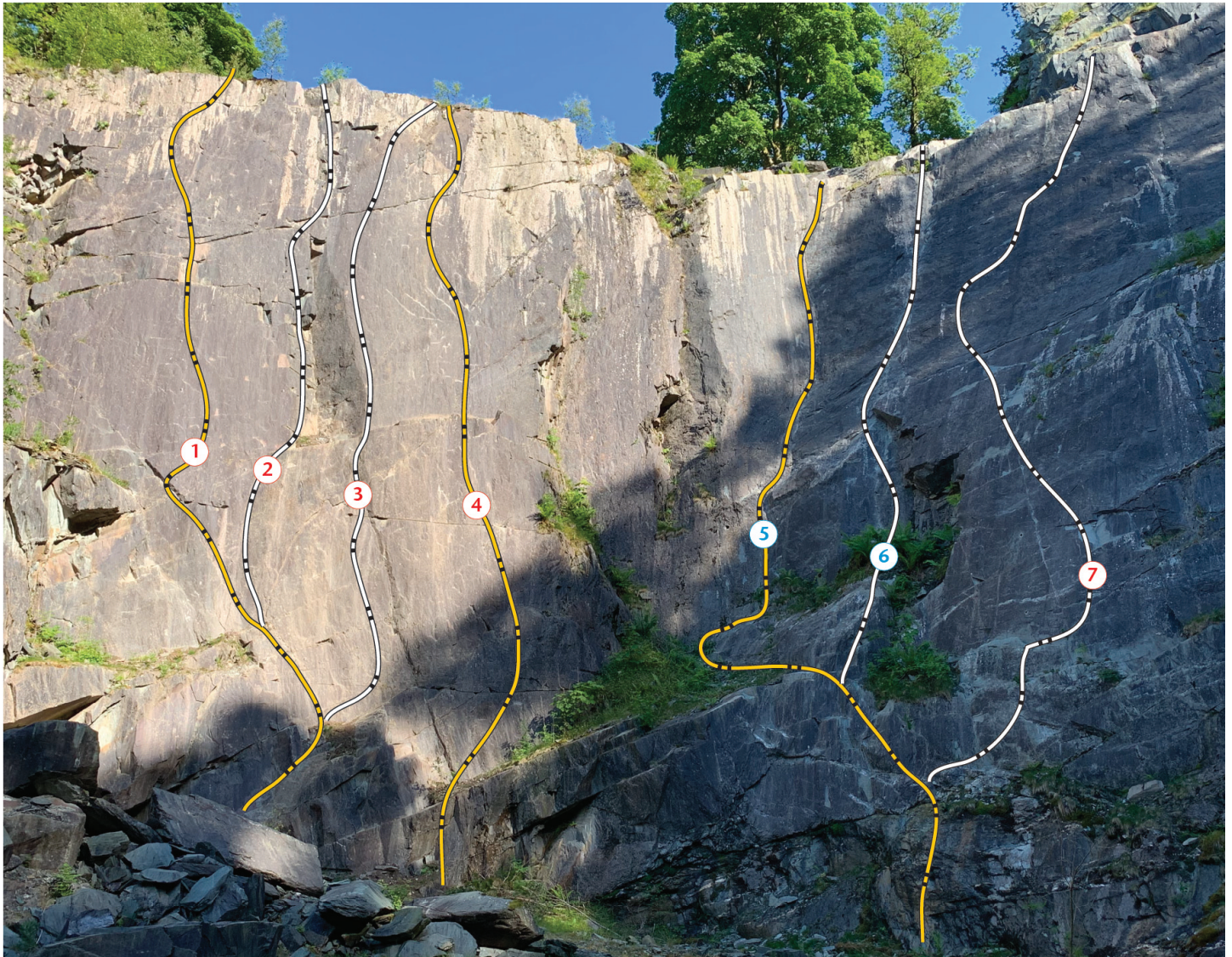
Peat Field Quarry

Park above Hodge Close Quarry or to the south, on the west side of the road. The best approach is down through the woods to the left of the gated road into the quarry site arriving at flat ledges and boulders at the top of the Western Walls in about 5mins (thus avoiding the owner's main entrance to the site and the access track into the quarry itself). There are three double bolt belay stations on the boulders along the top. Abseil from one of these to the base.