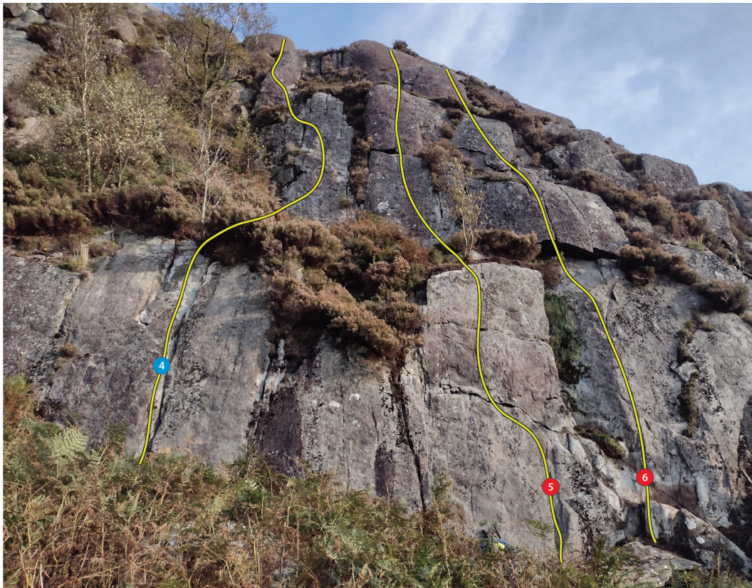
Not So Hidden Slab RHS