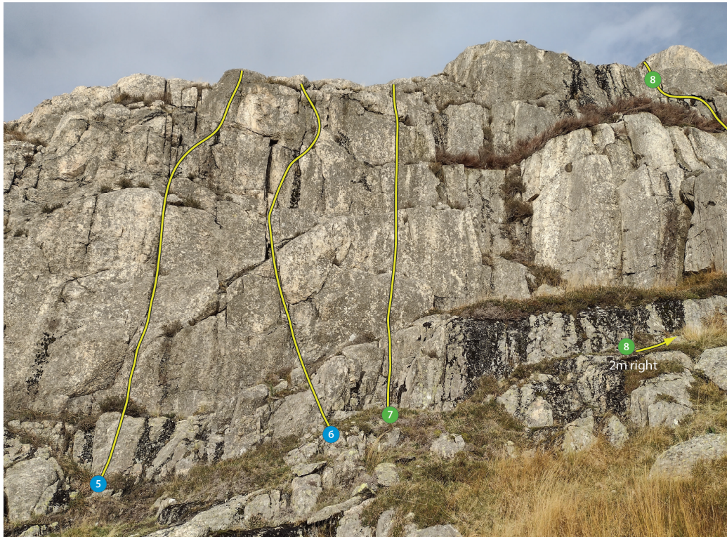
Cat Crag RHS

Further up to the right is a short steep wall with an obvious crackline up its left side.