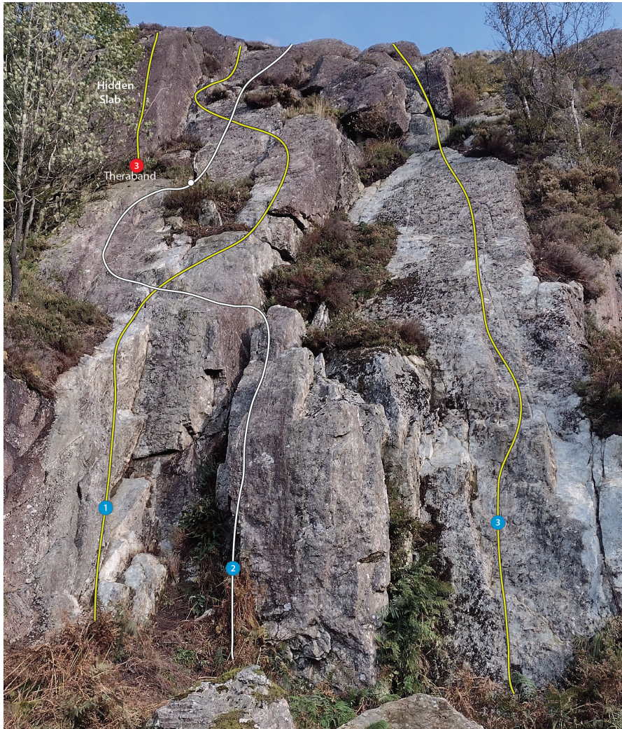
Not So Hidden Slab LHS

Abseil from a sling at the top of White Nile (in situ at the time of writing).