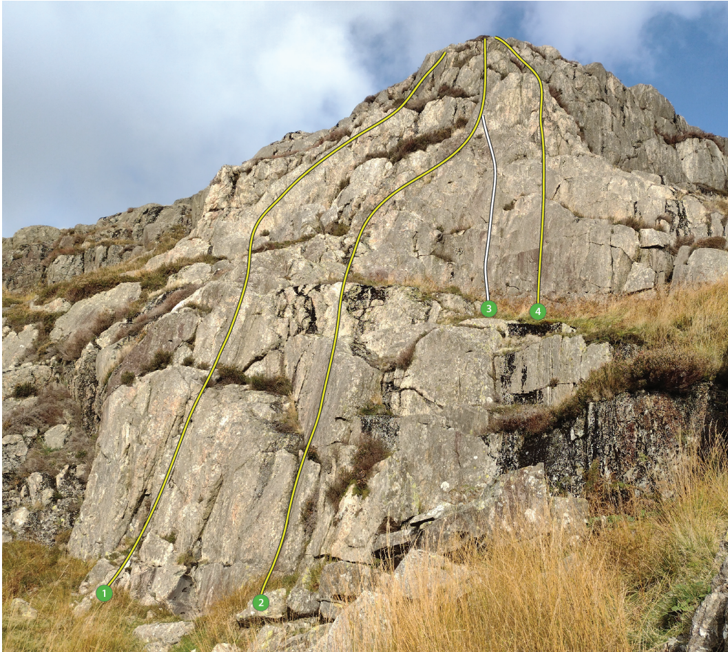
Cat Crag LHS

Follow the Crag Band approach as follows:- Coming from the south the parking area is some 400m past a cattle grid where the road rises. Follow the left-hand path east descending into woods and turning north up the valley to cross a footbridge over Tarn Beck. Continue uphill following the track across boggy ground, through a gate, then head leftwards across the fell towards the toe of the rocks, by a drystone wall. Then drop down beneath the toe of the buttress taken by The Band, follow the drystone wall up and cross it at its top then traverse the fellside left into the gully line before scrambling steeply up the slopes to the crag. (45 minutes).