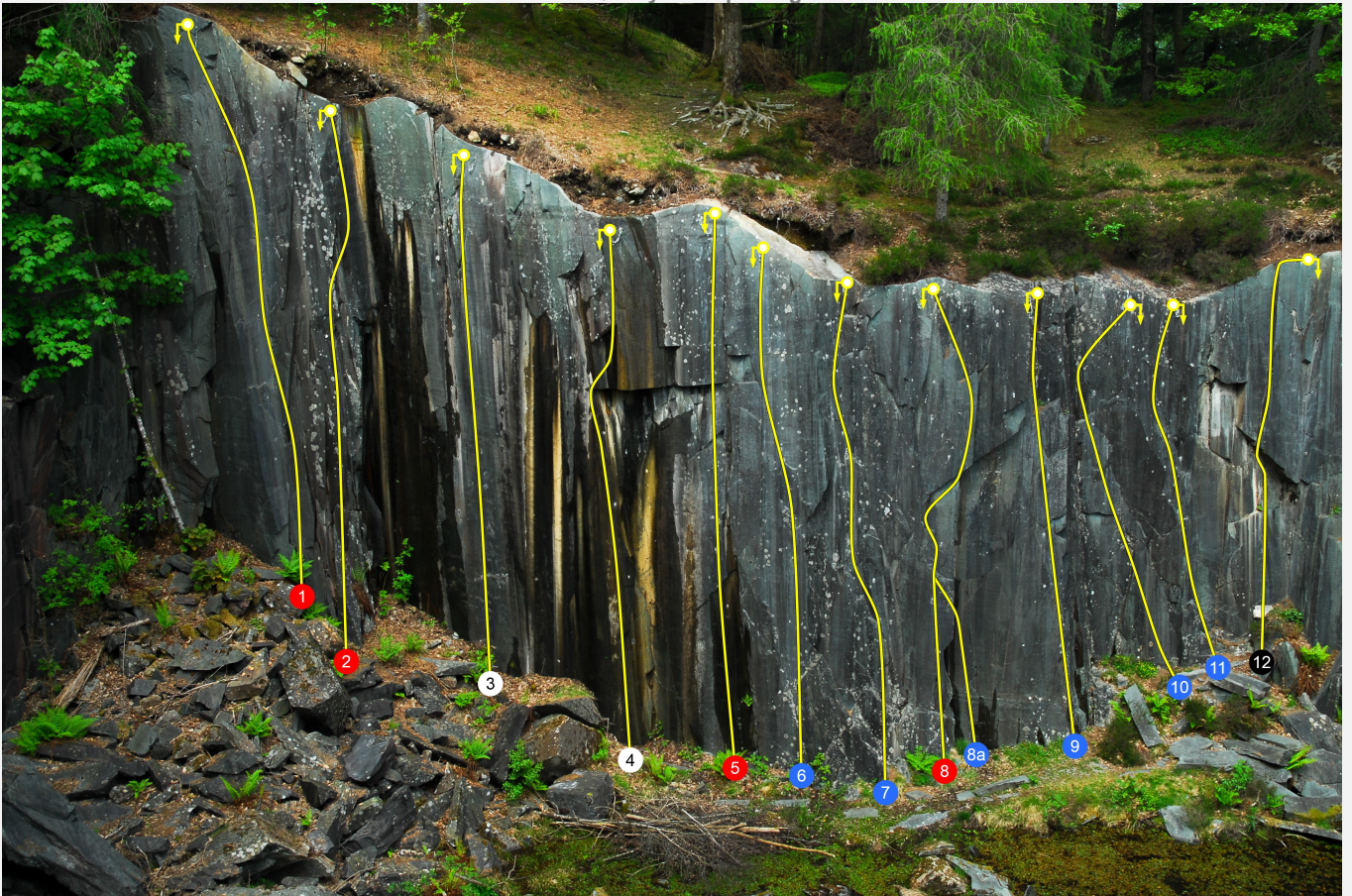
Dalt Quarry - North Side (Sunny Face) Lefthand section