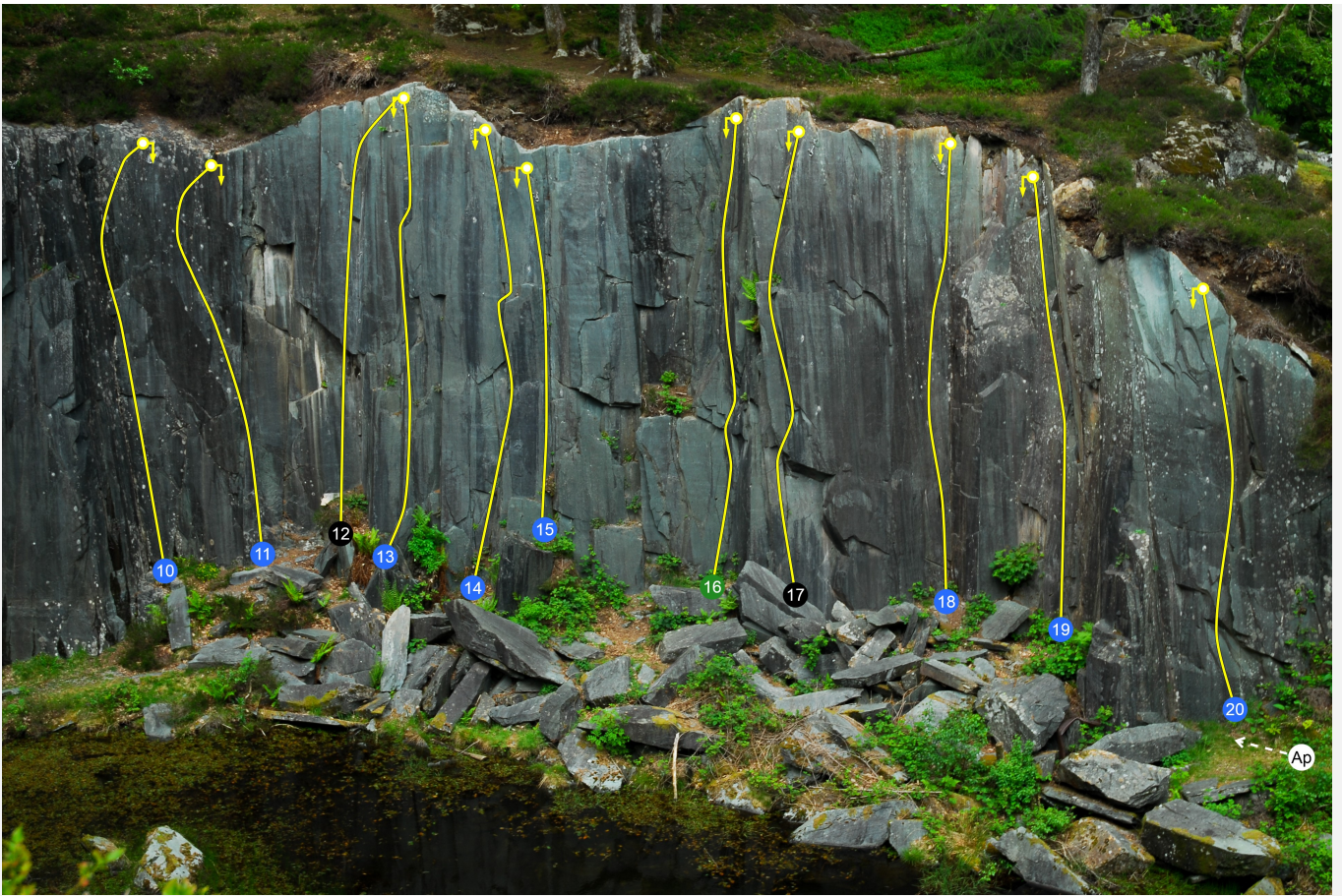
Dalt Quarry - North Side (Sunny Face) - Righthand section