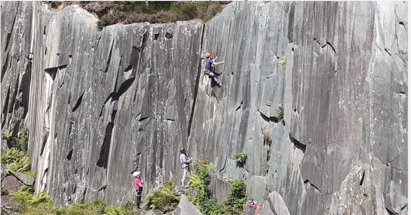
Dalt Quarry - Overall View of the "Sunny Side"

① Al's Slab F6b 11m Climb the sustained groove line.