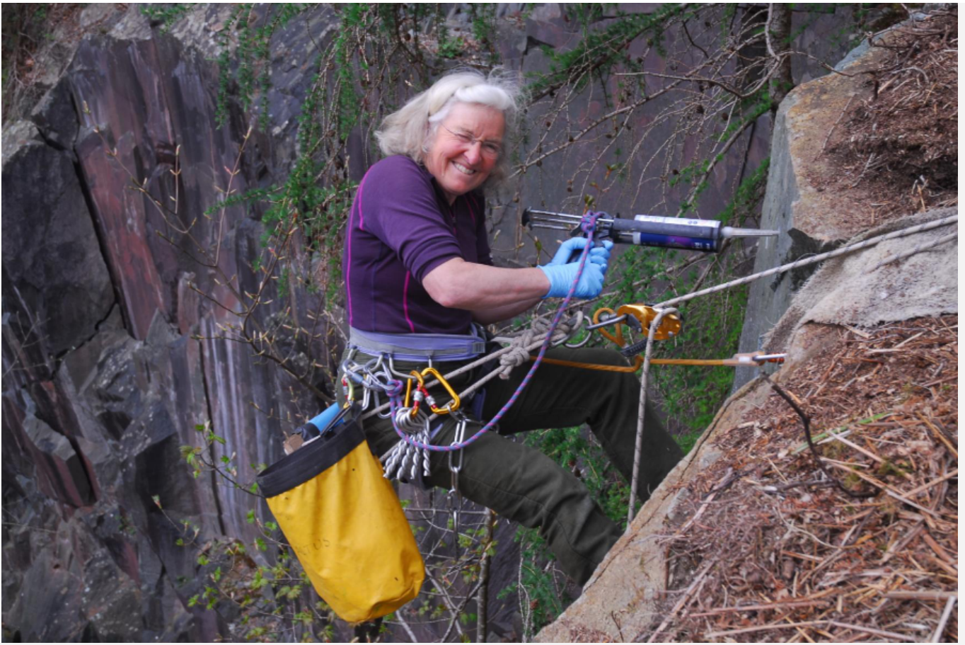
Dalt Quarry - bolt placing