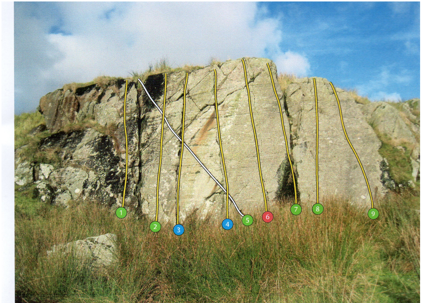
Pets Bridge Crag