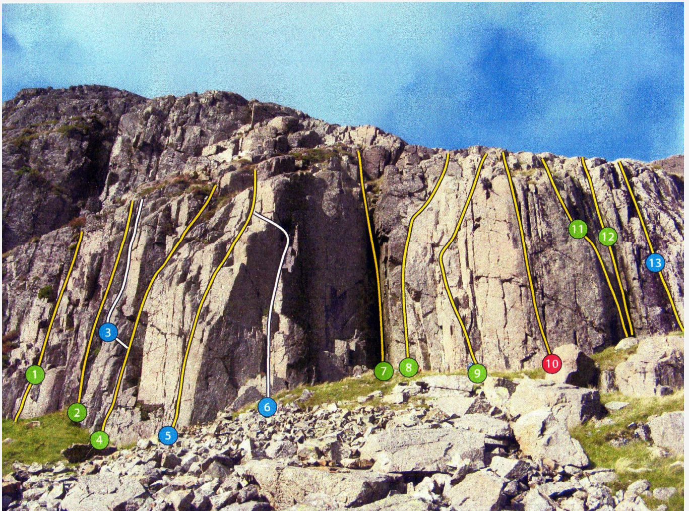
Upper Kern Knotts (LHS)